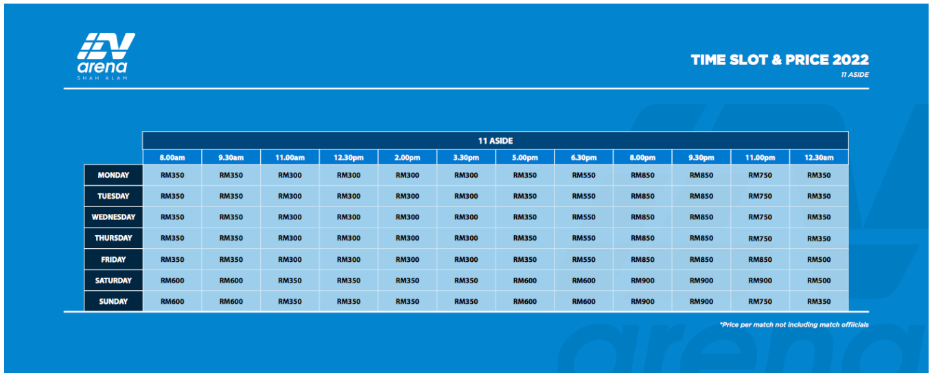
Timeslot & Price for 11 A-Side

The rates for the applicable Services can be referred to as attachments below: